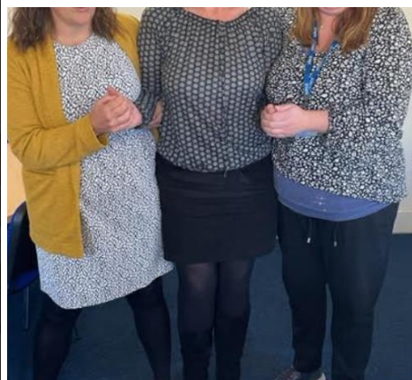
Reference: Double cup hold 5